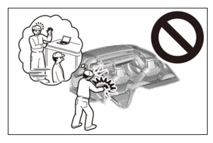
Click here NFO

Be sure to read Precaution thoroughly before servicing.